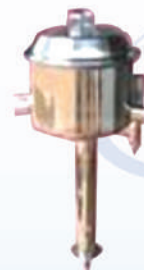
Distillation Water Unit