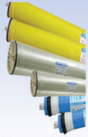
All Type of Membranes