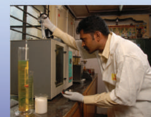
Chemicals & Galss Wares