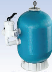
Swimming Pool Vessals