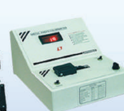
Photo Colori Meter