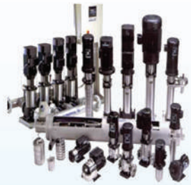
All Type of Pumps